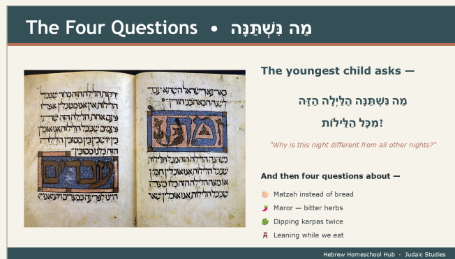
Slide 7 • Mah Nishtanah — the Four Questions