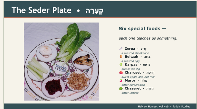
Slide 5 • The Seder Plate — six symbolic foods