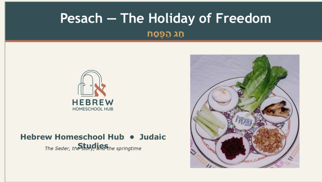
Slide 1 • Title slide

Four slides from the English deck — title, the Seder plate, the Four Questions with the Sarajevo Haggadah's Ma Nishtanah page, and the joyful close. The Hebrew deck mirrors each one with full nikud. (Four of fifteen.)