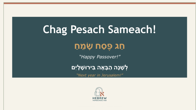
Slide 15 • Chag Pesach Sameach!