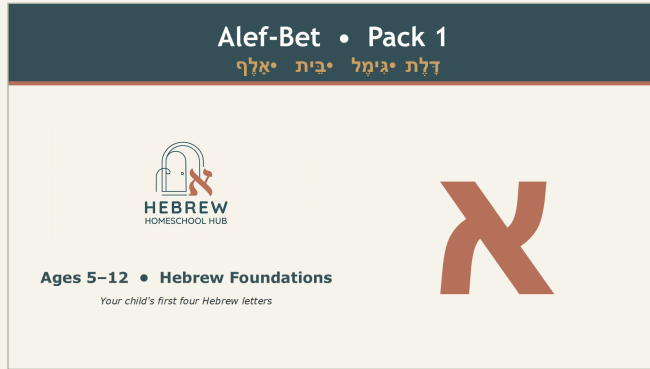
Slide 1 • Title slide

Four slides from the English deck — title, Meet Alef, Meet Gimel, and the payoff Read-a-Word slide. The Hebrew deck mirrors each one with full nikud. (Four of fourteen.)