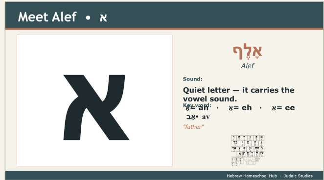
Slide 4 • Meet Alef