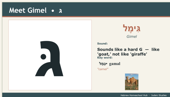
Slide 8 • Meet Gimel